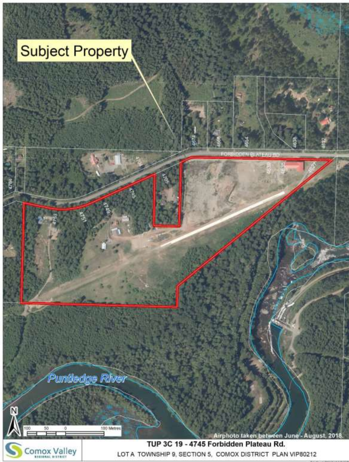
Figure 2: Aerial Photo