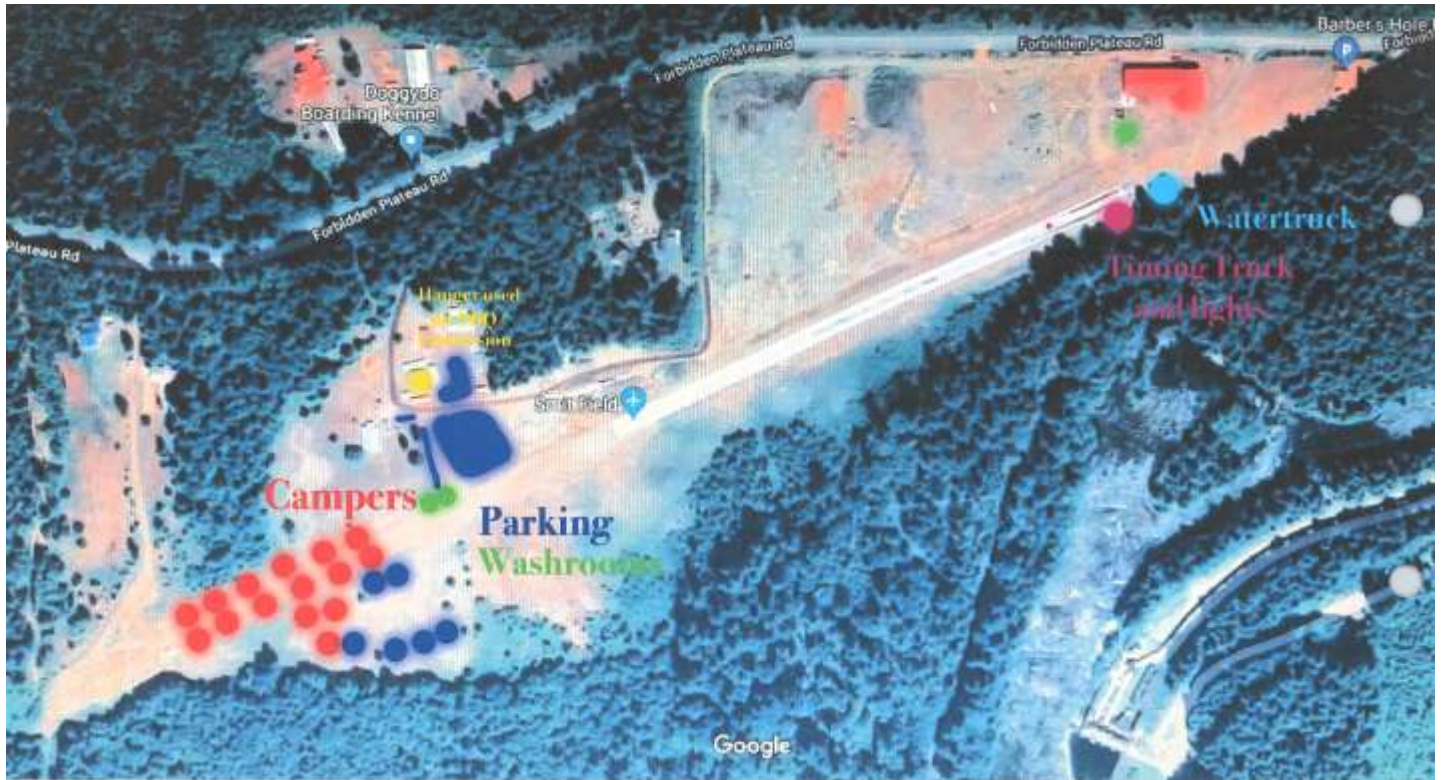
Figure 3: Site Plan, as Submitted by Applicants